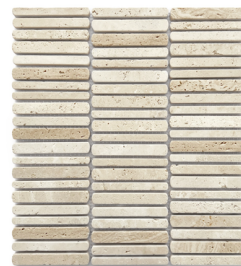
327 x 298mm SHEET 54618 (brushed)