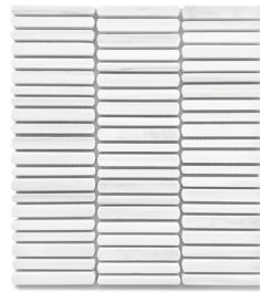
327 x 298mm SHEET 54616 (brushed)