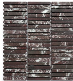
327 x 298mm SHEET 54623 (brushed)