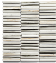
327 x 298mm SHEET 54619 (brushed)