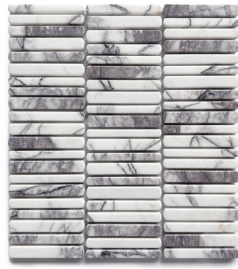
327 x 298mm SHEET 54622 (brushed)