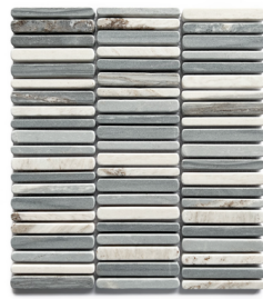
327 x 298mm SHEET 54620 (brushed)