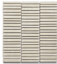
327 x 298mm SHEET 54621 (brushed)