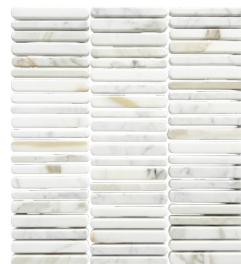
327 x 298mm SHEET 54617 (brushed)