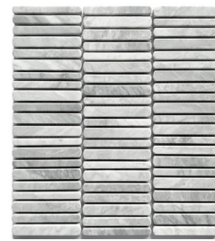
327 x 298mm SHEET 54625 (brushed)