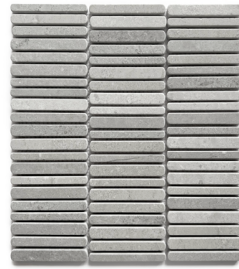
327 x 298mm SHEET 54624 (brushed)