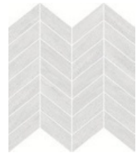
Chevron 298 x 238mm actual coverage: 0.0658sqm 51908 (matt) P2