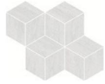
Rhomboid 264 x 238mm actual coverage: 0.06sqm 51904 (matt) P2