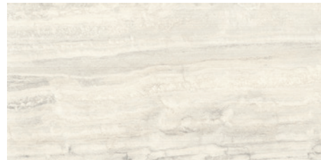
600 x 1200mm 53946 (matt) P2 53947 (textured) P5 53948 (rigato) P2