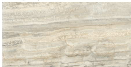
600 x 1200mm 53938 (matt) P2 53939 (textured) P5 53940 (rigato) P2