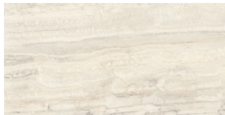
600 x 1200mm 53942 (matt) P2 53943 (textured) P5 53944 (rigato) P2