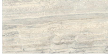
600 x 1200mm 53971 (matt) P2 53972 (textured) P5 53973 (rigato) P2