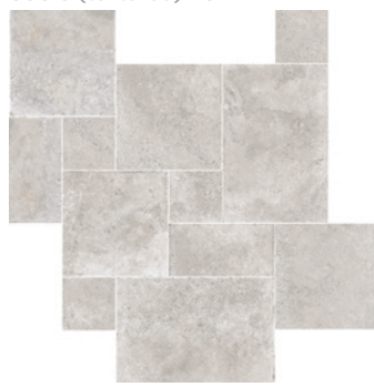
French Pattern* 50519 (matt) P4 50520 (textured) P5