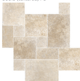
French Pattern* 50514 (matt) P4 50515 (textured) P5