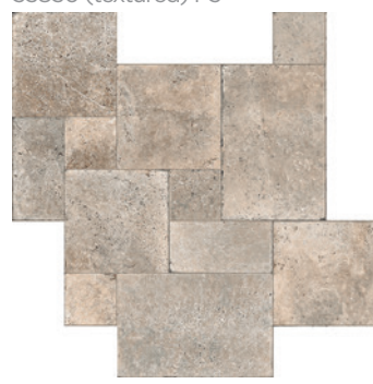
French Pattern* 53886 (matt) P4 53831 (textured) P5