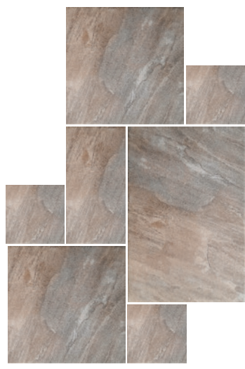
Modular (indent option available) 53646 (textured) P5