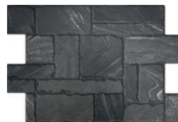
440 x 660mm (indent option available) 53696 (textured) P5