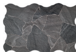
440 x 660mm 53642 (textured) P5