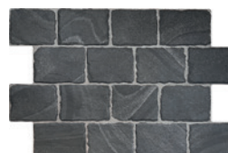
440 x 660mm 53641 (textured) P5