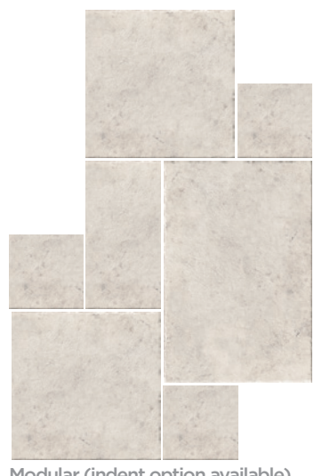
Modular (indent option available) 53650 (textured) P5