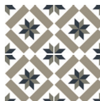
200 x 200mm 51946 (matt)