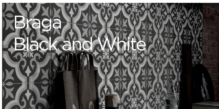
Braga Black and White