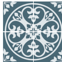
200 x 200mm 51954 (matt)