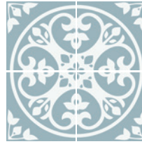
200 x 200mm 51949 (matt)