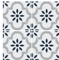
200 x 200mm 51951 (matt)