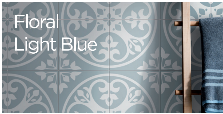
Floral Light Blue