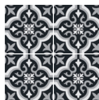
200 x 200mm 51947 (matt)