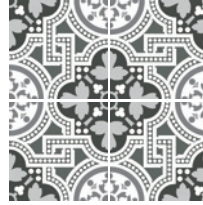
200 x 200mm 52274 (matt)