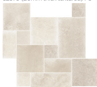
French Pattern 52974 (matt) P3 52975 (textured) P5