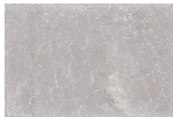
604 x 906mm 52984 (matt) P3 52985 (textured) P5 52987 (20mm thick textured) P5