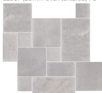
French Pattern 52982 (matt) P3 52983 (textured) P5