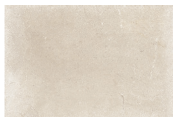
604 x 906mm 52976 (matt) P3 52977 (textured) P5 52979 (20mm thick textured) P5