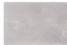
408 x 614mm 52980 (matt) P3 52981 (textured) P5