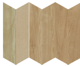
110 x 540mm Rhomboid 53028 (matt)